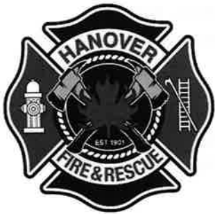
Hanover Fire Department Organizational Chart